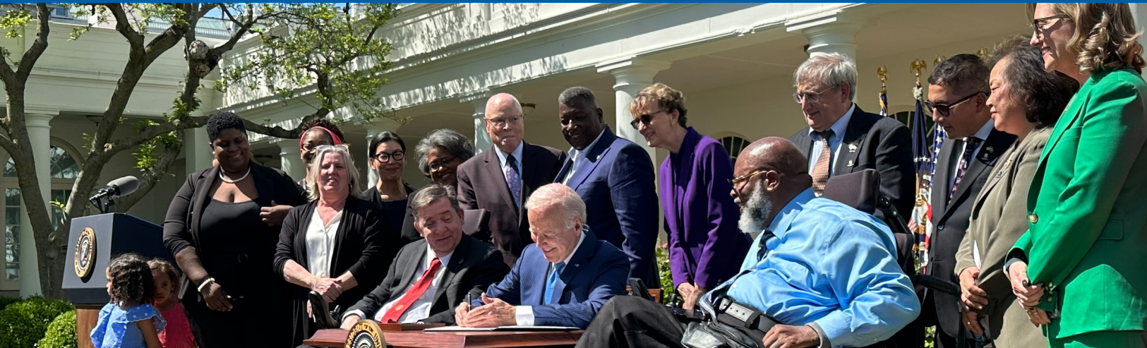
President Biden signing the Executive Order in the Rose Garden