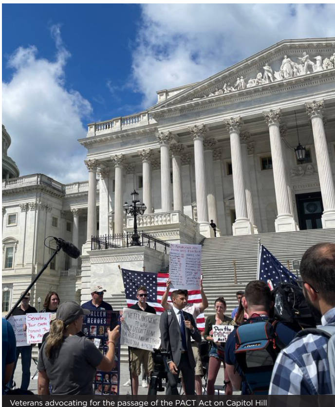
Veterans advocating for the passage of the PACT Act on Capitol Hill

WWP hosted multiple webinars educating Alumni about how the new law will work and how they can access care and benefits. Some of those materials can be accessed online here: Toxic Exposure - PACT Act Info for Veterans | WWP (woundedwarriorproject.org) .