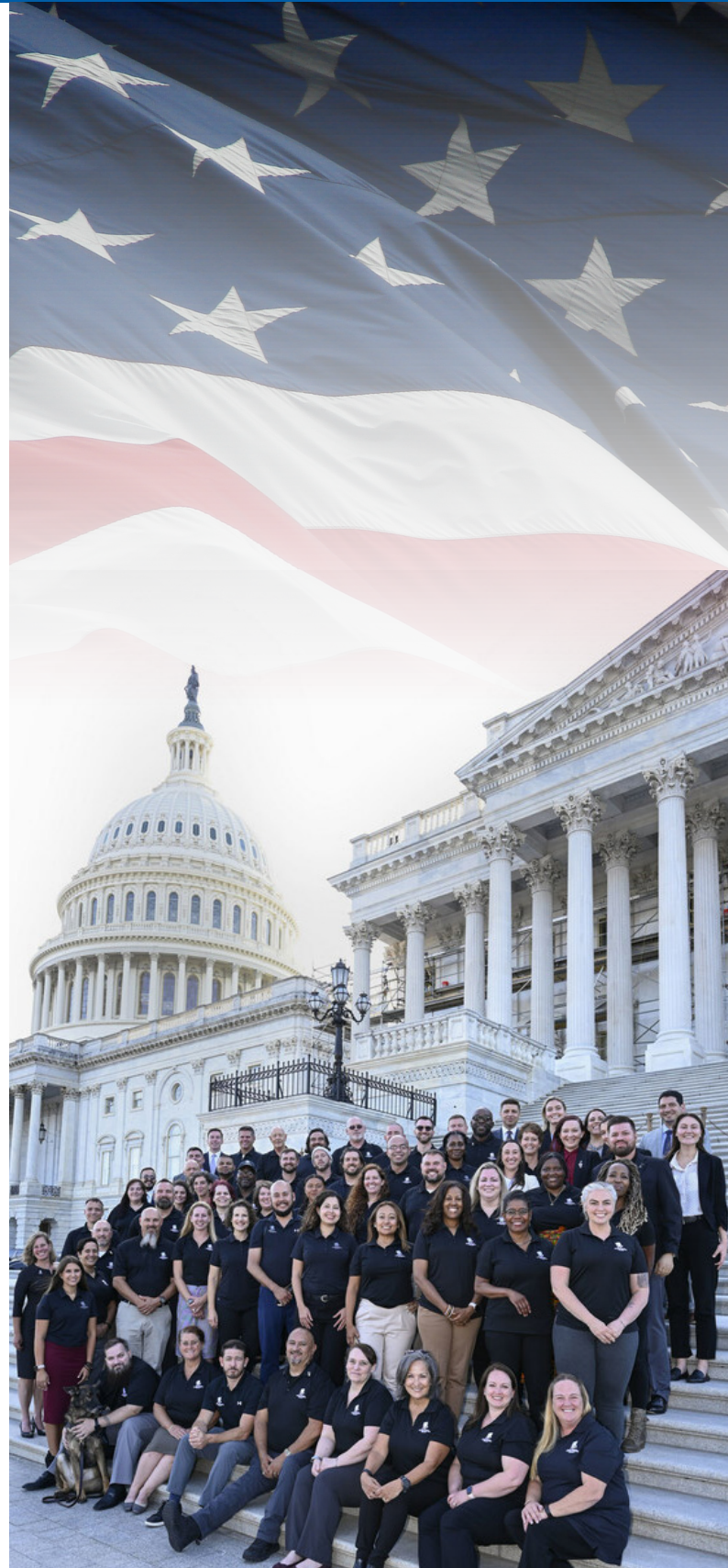
Warriors advocating on Capitol Hill on behalf of their fellow veterans

A: Making a direct impact on your care is one of the most empowering things I can tell a veteran to do. You may not realize it, but you have a powerful voice, and people will listen. Our representatives cannot lead effectively without knowing the needs of the people. You can stand up and state you and your fellow service members' needs. You get the chance to tell someone what's wrong and offer ideas on how to improve the system. As Mahatma Gandhi said, "Be the change you want to see in the world."