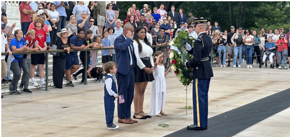
Warrior has the honor of participating in Memorial Day commemorations at Arlington National Cemetery.

I am also grateful to see firsthand how many fellow veterans and supporters are committed to helping warriors through volunteer work, advocacy, and support. The entire WWP team is honored to work alongside you on their behalf.