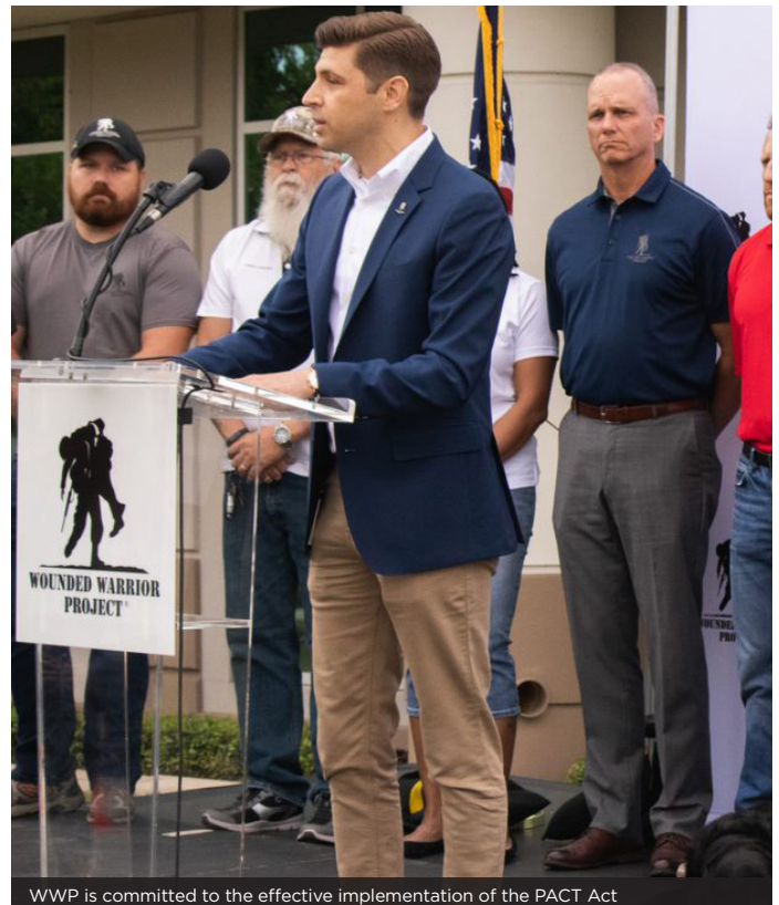
WWP is committed to the effective implementation of the PACT Act

WWP also joins VA in encouraging veterans and survivors to seek assistance from a VA-accredited Veteran Service Organization and file a VA claim before Aug. 9, 2023 .