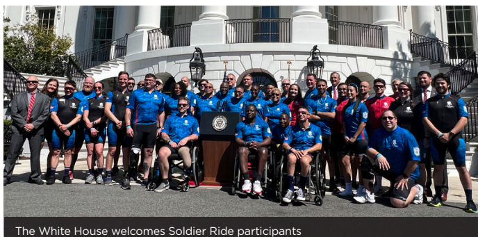
The White House welcomes Soldier Ride participants

On day three, wounded warriors visited the White House, where they were cheered on and hosted by Vice President Kamala Harris and Second Gentleman Douglas Emhoff on behalf of President Joe Biden and First Lady Dr. Jill Biden, who were overseas. The warriors and caregivers were welcomed by members of the Biden-Harris Administration and First Lady Jill Biden's Joining Forces initiative and was